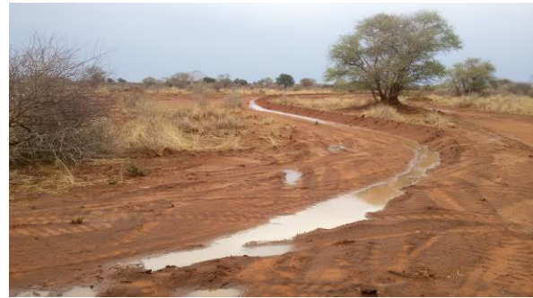
Figure 3: Water from a rain shower of 11 mm is held back in a contour ditch with bund for growing useful trees in a fruitful landscape.

Bunds are usually constructed from dug soil that is heaped in lines (Figure 3), sometimes referred to as mounds, banks or berms. Bunds constructed on the downslope side of contour ditches provide the opportunity to grow grass to stabilise the bund. If the bund is built wide, with its downslope side having a low gradient, and if a shallow (less than 30 cm) ditch is dug below it to collect runoff from this bund slope as well as some of the water spilled over spillways, then water will be available for both the grasses grown on the bund and trees grown below the bund. When the ditch fills, the water spills over the length of the ditch, calmly. Mulch pits can be located on the upslope side of the contour bund to process and spread mulch along the bund's length to release in-ground fertilised water.