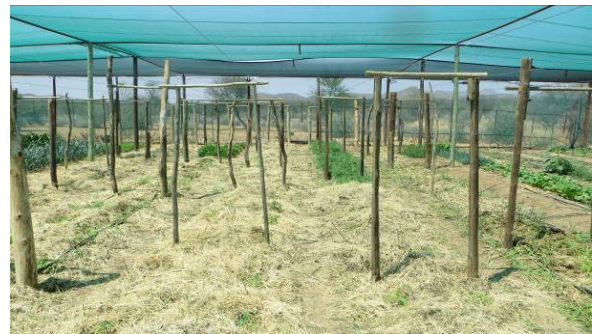
Figure 1: Drip irrigation through thick mulch strips alongside which vegetables grow.

Vegetable gardens that were visited during the tour received irrigation water onto the soil from above. Since most of the gardens were located on gradients, even if very slight, the irrigation could be more effectively applied through a thick layer of mulch upslope of the vegetables, to allow water to pick up nutrients from the decomposing mulch and flow slowly past vegetable roots, permitting them to drink and feed as required. Long lines of drip irrigation could be applied along heaps of mulch in which creeping plants such as pumpkins could be grown, whose roots would assist in converting the lower layers of mulch to compost more efficiently than done in compost heaps (Figure 1). Key species for processing mulch include pumpkins, potatoes and tomatoes.