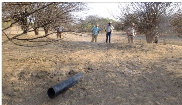
Figure 4: A pipe in a dam wall provides opportunities to pulse the release of water to favour grass growth, if fitted with a valve at its outlet.

Where pipes are placed through dam walls to allow water to trickle through slowly (Figure 4), it would be more effective to place a valve at the outlet, so that the stored water could be released in pulses as happens frequently in nature (Middleton 1999). This also avoids unnatural waterlogging of soil that would otherwise become anaerobic and unproductive. In case water is held in a contour ditch and could be syphoned over to lower ground, the opportunity also exists to alternate the locations from where the water is released, as happens in nature by reeds growing where water previously escaped, thereby blocking further releases there.