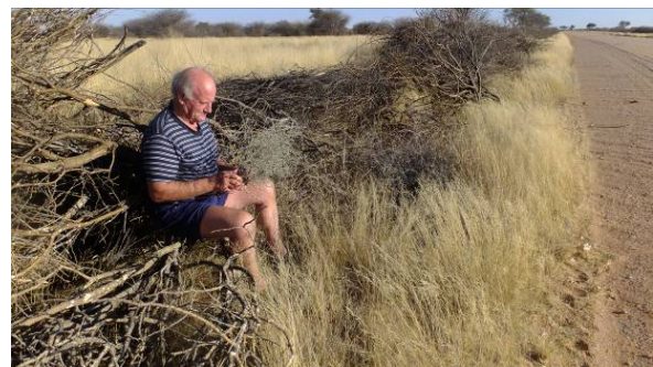
Figure 2: Bush lines provide good opportunities for establishment of edible plants, especially if aligned on contours.

Along several of the roads driven during the tour were piles of bush that had been chopped in the road verges (Figure 2). Similarly, many of the rangelands driven past were encroached by bushes. If bushes were cut in strips along contour, the cleared bushes could be piled on the upslope side of the cleared strips where they would trap mulch and soil carried in runoff water, thus eventually creating a step in the landscape, below which the strip of grass would slowly receive nutrition from the bushed strip upslope. The bush mulch on contour would be ideal for growing edible bushes and trees in, so that they could be protected from herbivores until large enough to withstand occasional browsing. They could be planted either by seed scattered into the bush line, or seedlings transplanted into it, or cuttings or larger truncheons planted among it. If planted as seedlings, the longstem tubestock method of raising and planting the seedlings would ensure better survival (Australian Plants Society 2010). Cut bush can also be used to construct filters that divert water flow away from gullies.